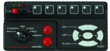
RLS Control Head