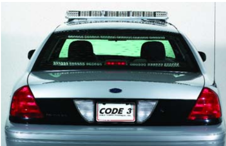
Before system activation