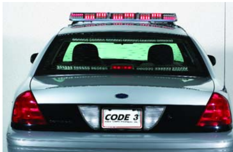
Red LEDs for daytime operation