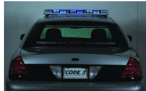
Blue LEDs for nighttime operation