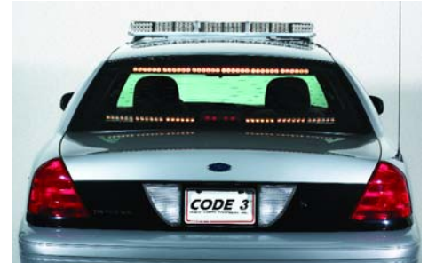
WingMan™ directional lighting